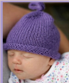
PURPLE HATS FOR BABIES

Contact Lupina Doyle for more information at 336-202-0211.